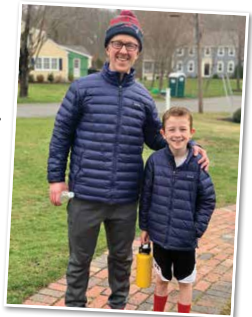
Being a boy dad is the best.

In the blink of an eye he turned 9 last month, which I still can't get my head around. In 9 short years (that I am